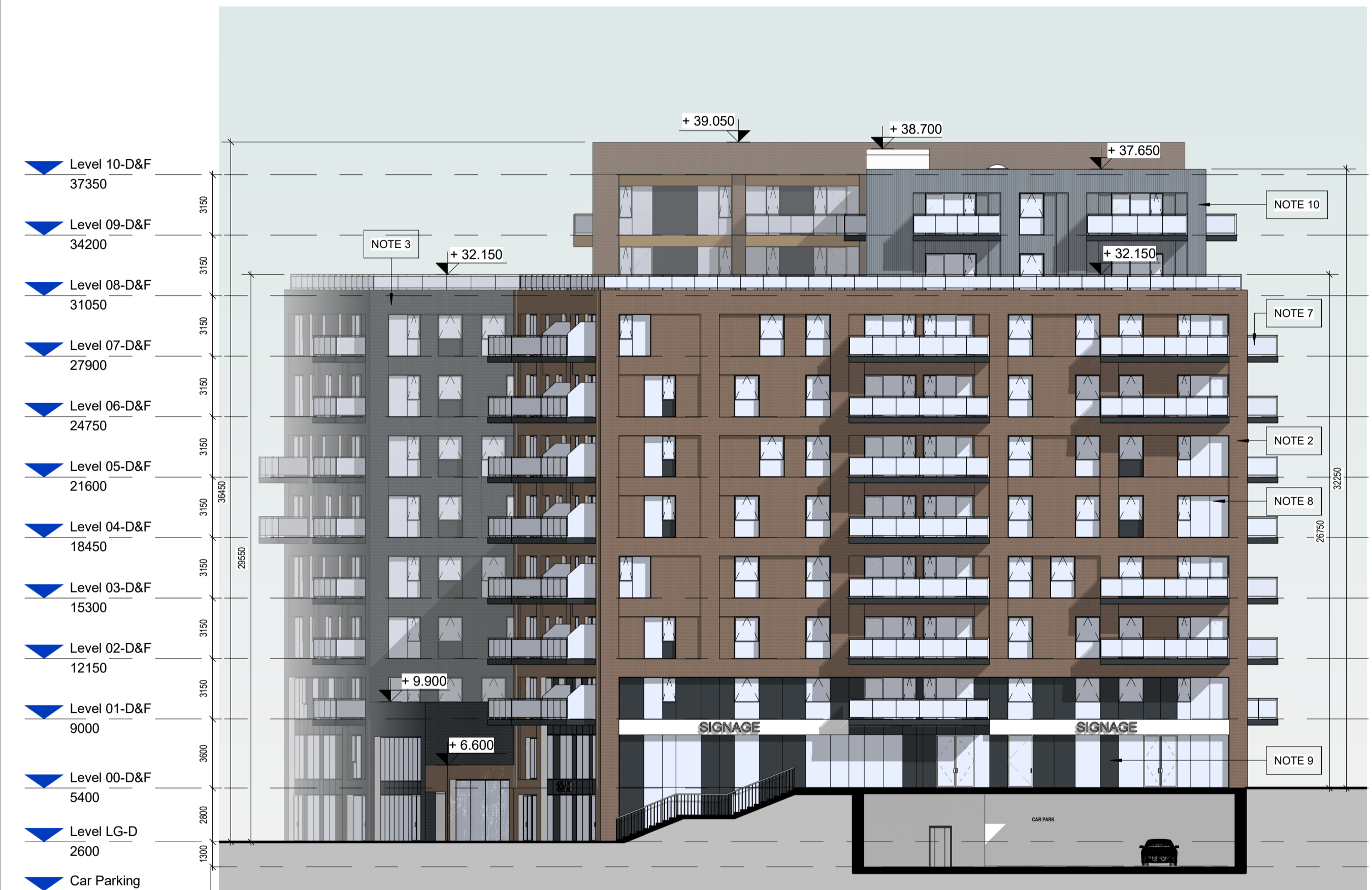
1 BLOCK D-EAST ELEVATION 1 : 200

Please consider the environment before printing this sheet