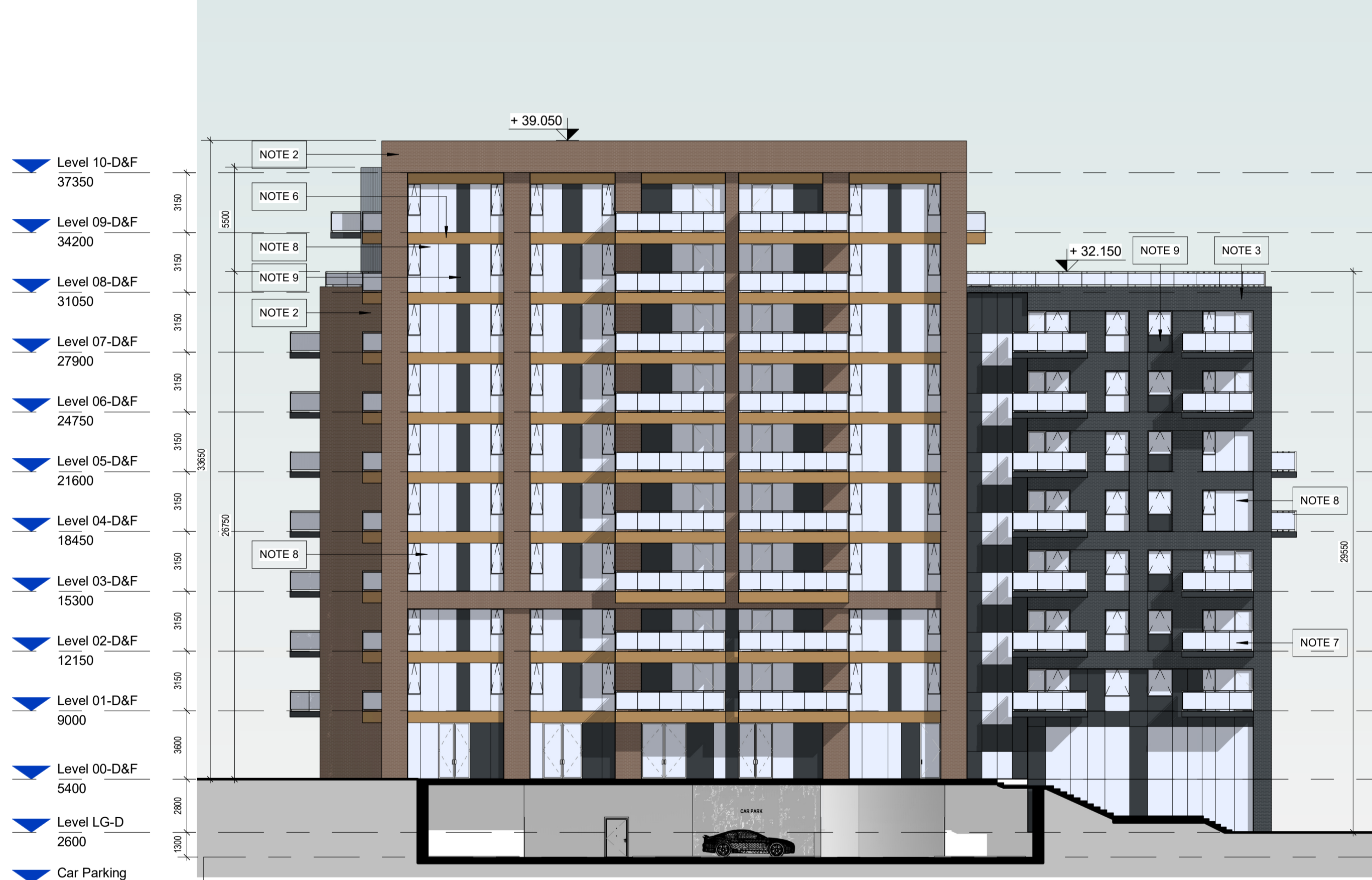
2 BLOCK D-WEST ELEVATION 1 : 200